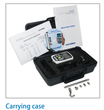
Cushioned hard plastic carrying case provides storage space for the gauge, AC adapter, and attachments.