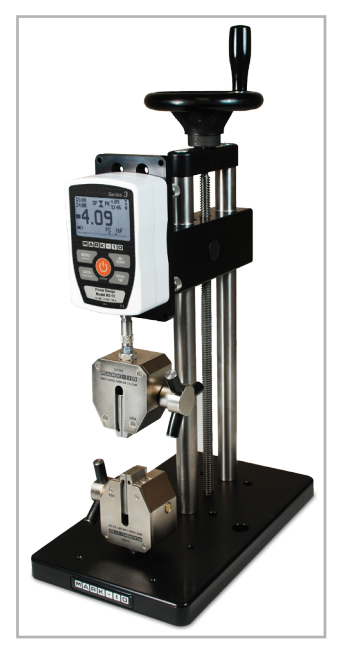
Shown with an ES20 test stand and G1061 wedge grips

Series 3 gauges include MESUR<sup>™</sup> Lite data acquisition software, for tabulation of continuous or individual data points. One-click export to Excel button easily allows for further data manipulation.